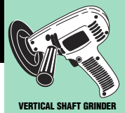
VERTICAL SHAFT GRINDER