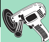
VERTICAL SHAFT GRINDER