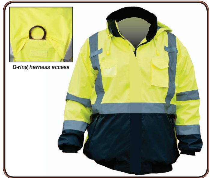
D-ring harness access

Recommend washing in tempered water not exceeding 140° F or 60° C. Wash in a 5-10 minute cycle time or hand wash. Rinse in cold water. Tumble dry at temperature not exceeding 104° F or 40° C, do not wring. Do not wash in biological powder, wash as synthetics. Maximum of 25 wash cycles.