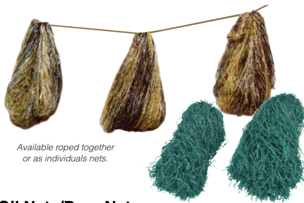
Available roped together or as individuals nets.