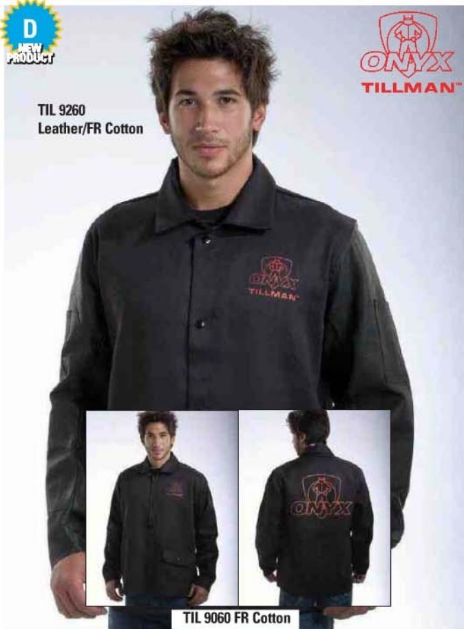
TIL 9260 Leather/FR Cotton