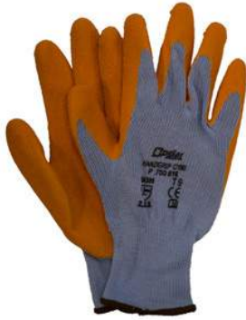
OPSIAL HANDGRIP C150 GLOVES

STARTS TUESDAY, JUNE 15 TH THRU JULY 2, 2021