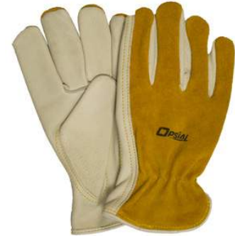
OPSIAL COWHIDE SPLIT BACK DRIVERS

Top grain pearl leather palm and bourbon split leather back. Unlined. Keystone thumb.