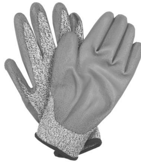
OPSIAL PU COATED A5 GLOVES | P702G24

Opsial A5 cut resistant glove with polyurethane palm coating and offers great dexterity.